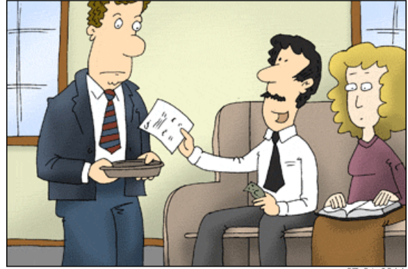
07-04-2011 I HAVE A GROUPON FOR BUY 5% TITHE AND GET 5% FREE

Apportionments are still behind, however we were able to begin paying them once again with the help of the Parsonage rent. We were also able to pay one months back payment, so now we are only about $1600 behind for this year. All other bills are paid in full, thanks to the faithful.