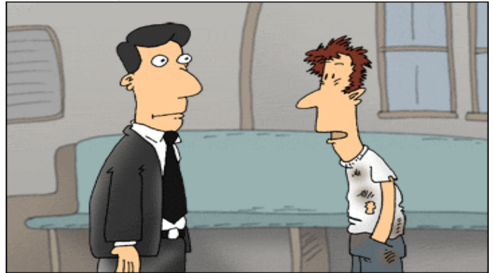
02-04-2011 THE BAD NEWS IS I LOST EVERY PENNY I OWNED IN SOME BAD INVESTMENTS ... THE GOOD NEWS IS I'M FINALLY READY TO START GIVING 10%

The Griffin District Methodist Men are providing the "Feed the Hungry" Thanksgiving meal again this year at Forest Park UMC on November 19 from 1130 am - 330 pm. If you know someone who is hungry, let them know and if you are able to stop by and assist in feeding the Hungry, you would be blessed in your service.